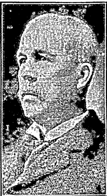
Vice President of First National Bank at Brainerd.